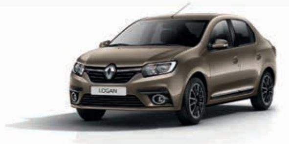
Mink Brown (TE)

O : opaque colours. MP : metallic paint.