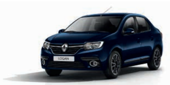
Cosmos Bleu (TE)