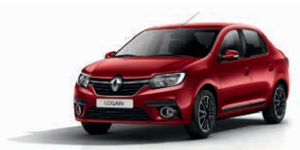
Flame Red (TE)