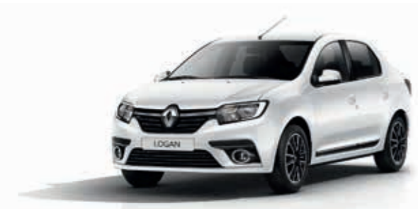
Glacier White (O)