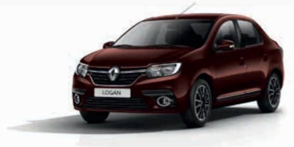
Tourmaline Brown (TE)