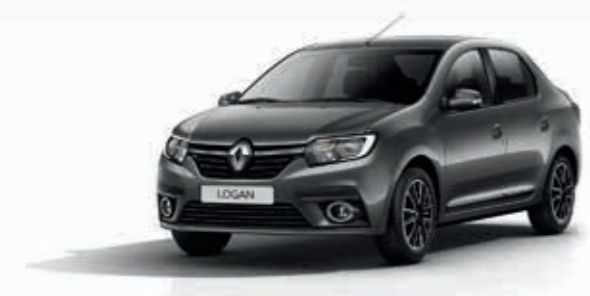
Comet Grey (TE)