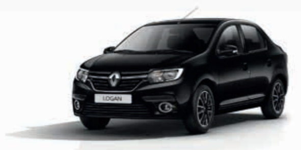
Pearl Black (TE)