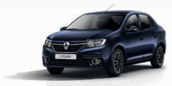
Navy Blue (O)